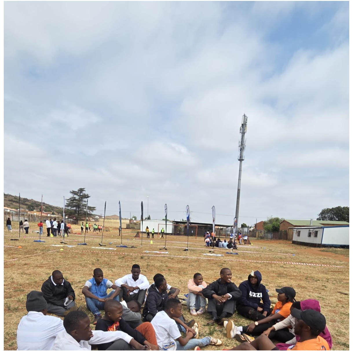
DISCUSSIONS ABOUT UNDERAGE DRINKING AND SUBSTANCE ABUSE