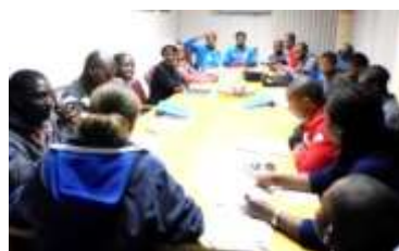
Youth sport leaders attending the workshop on personal development