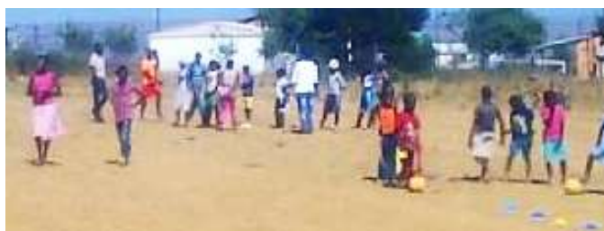
Some activities during the holiday activities