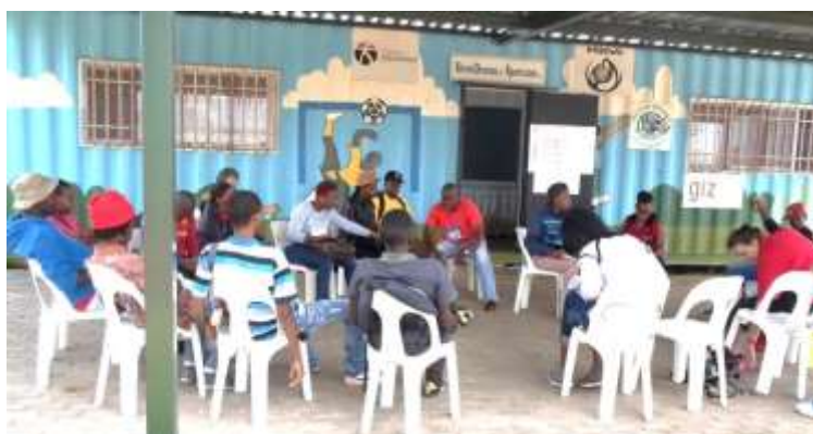
Youth sport leaders working on their task