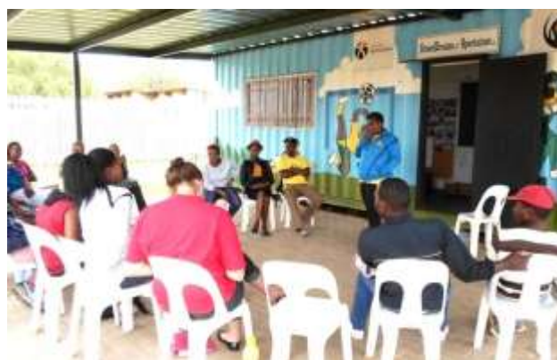
A youth sport leader giving feedback