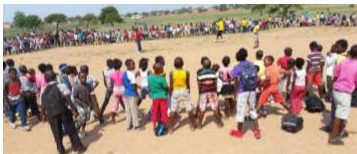
Mass warming-up session

ACTIVITIES The mass sport activities involved mass warming-up, cricket, netball, broom hockey, streetsoccer, tag-rugby, volleyball and a variety of recreational games