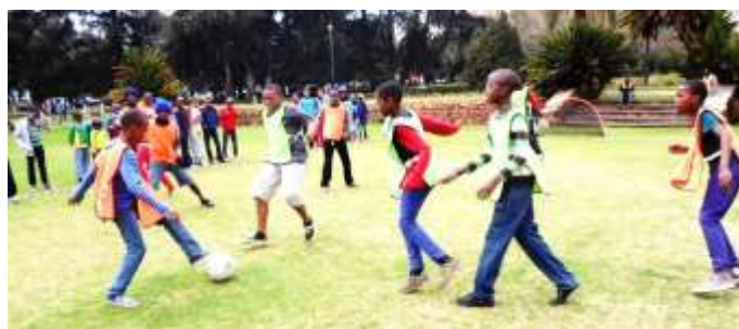
Street children and primary school kids enjoying Streetsoccer