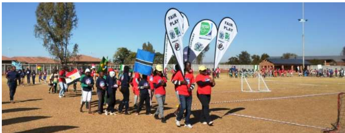
March past of 20 participating teams

VENUE Rethabile Sport Ground, Mamelodi ATTENDANCE 206 youngsters (164 kids & 42 youths with a disability)