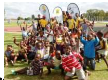
Middle distance runners