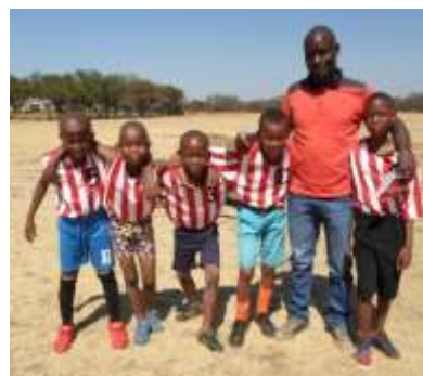
Future 'Bafana' stars posing

PRESENTATION & ORGANIZATION The tournament was presented by Altus Sport (NPO-NGO) and Vukani Community Development Organization in New Eersterus, Hammanskraal. Winning team: The Bullets team from Hammanskraal village near Carousel