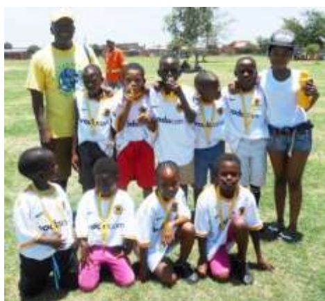
Winning team posing with their medals