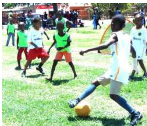
Streetsoccer in full swing