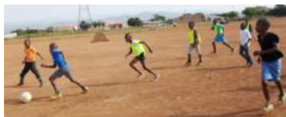
Streetsoccer in full swing