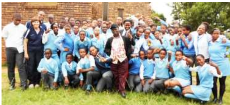
Participants posing for the photo

VENUE Lucas Moripi Super Soccer Stadium, Atteridgeville ATTENDANCE 51 (35 male and 16 female) representatives from clubs and relevant organizations.