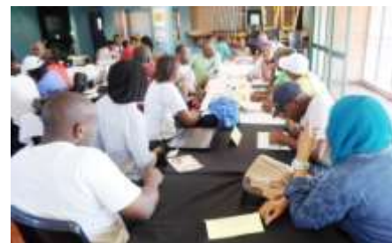
Some activities at the workshop in Atteridgeville, Tshwane

VENUE Rethabile sport ground, Mamelodi ATTENDANCE 122 (65 boys & 57 girls) primary school kids from Mamelodi