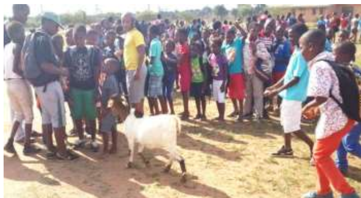
Even a goat attended!

The youngsters thoroughly enjoyed the event, which was also supported by Let's Play of SuperSport and televised.